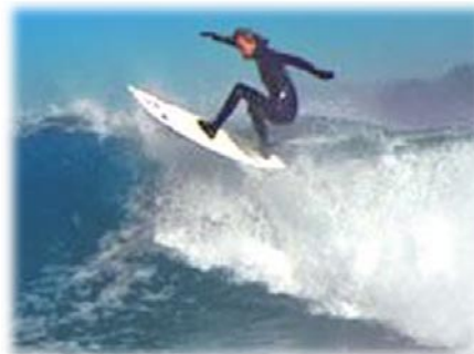
Surfing Nootka Island

Inlet. In summer and fall of 2004, Tahsis residents saw the first pioneers testing the inflow and outflow winds on the inlet.