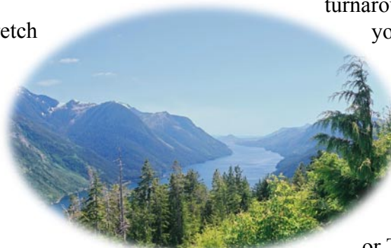
View from Lookout to Nootka

A great place to start a more extended hike is from West Bay Park, just past Maquinna Resort at the end of town. There are shorter trails accessed from the