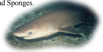
Prehistoric 6-Gill Shark

Tahsis and Leiner Rivers provide excellent snorkeling opportunities in the late summer and early fall when the Salmon return to spawn. At that time the rivers are full of Coho and Chinook, as well as the occasional Pink, Chum, and Sockeye.