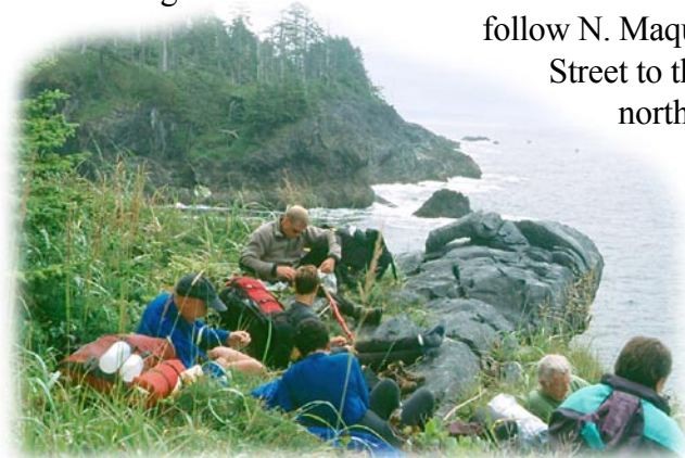
Nootka Trail - Maquinna Point

follow N. Maquinna Street to the north end of