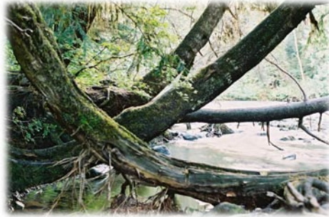
Leiner River Campsite

A short drive past the Maquinna Resort is the turnaround and parking lot for West Bay Park. There are washrooms, and stairs down to the rock beach at West Bay. This sheltered little bay is an exception to the deep waters of Tahsis Inlet; it is shallow and southwesterly facing, catching the sun and warming up to comfortable swimming temperatures. Locals frequently come down here to swim, sunbath and walk the short trails in this area.