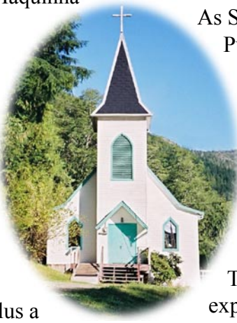
St Joseph’s Church

Park at the top of Princess Victoria View.