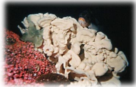
Cloud Sponge and small Rockfish

Little Espinoza Inlet has remarkable biodiversity, and is also a favoured diving spot.