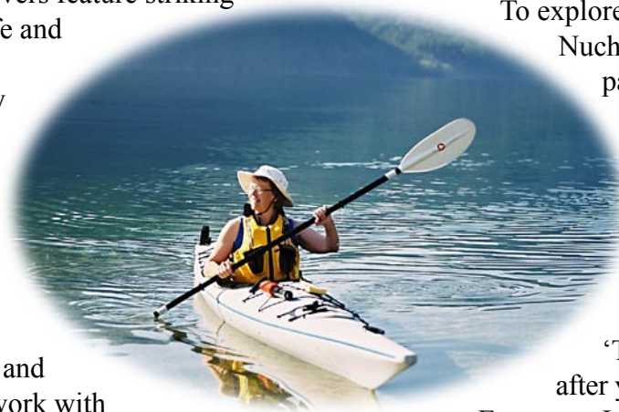
Kayaking Tahsis Inlet

There are also excellent camping spots on Catala Island and Yellow Bluff on the North Shore, but access to both requires crossing open water when the tides are good and water is calm. Fresh water is not always available at either camping spot. From Rosa or Garden point, kayaking in Mary Basin up to Ferrer Point has many advantages. There are lots of little streams, safe protected kayaking, sea otter families, eagles, bears, and marine birds. Mary Basin