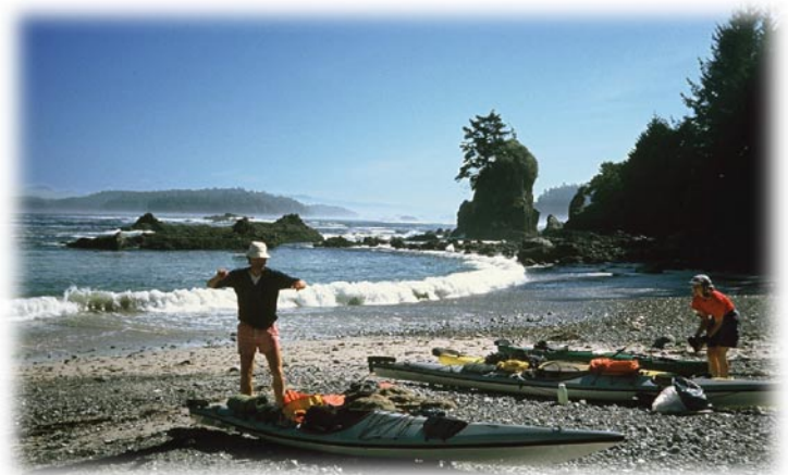
Kayaking Nootka Island